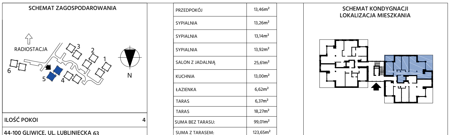
RZUT MIESZKANIA, SKALA 1:100@a4

wymiary na rysunku nie uwzględniają grubości tynku